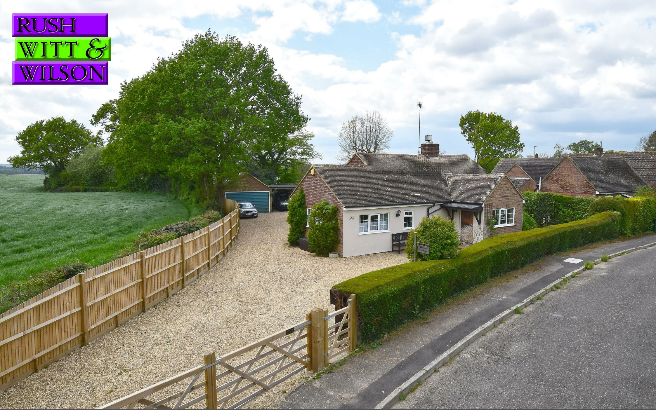
Hunter Cottage, Parkfield Crescent Standen Street, Iden Green, Kent TN17 4HR Offers In The Region Of £695,000